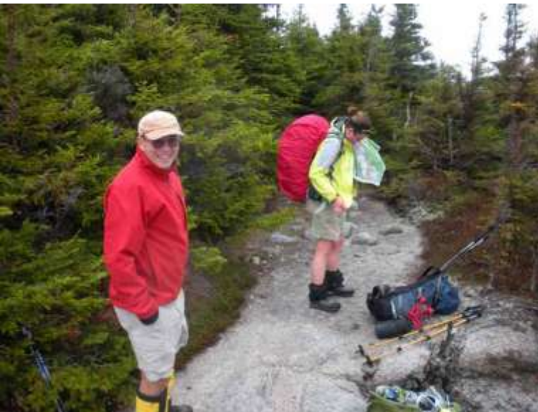
Hikers on an AMC trip enjoy the Webster Cliff trail

This workshop is for any adult who wants to learn and have a great time! It begins at 7:30 Friday evening and ends 4:30 Sunday afternoon. Cost $130.00 (AMC members), $150.00 (nonmembers), includes lodging, excellent meals, materials, and instruction.