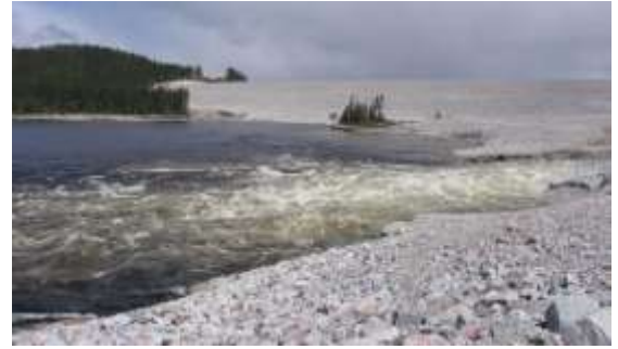
Rupert Diversion Dam

I've now met many paddlers who have paddled rivers that are no more – the Eastmain, La Grand, Opinaca, Caniapiscau, Manicouagan, Outardes, Pagan, now the Rupert, and soon the Romaine - and seen sights such as Churchill Falls that now exist only in pictures. The Great Whale River has been saved for now by the publicity of the Cree, Inuit and others paddling it to draw attention to it. Alas, Vermont just certified Hydro Quebec's huge scars on the earth as green renewable energy because not enough people knew or cared what was happening.