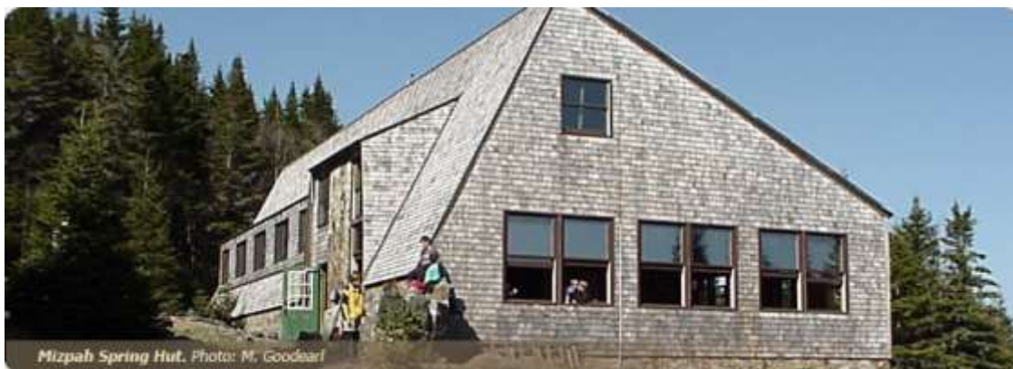
Mizpah Spring Hut.