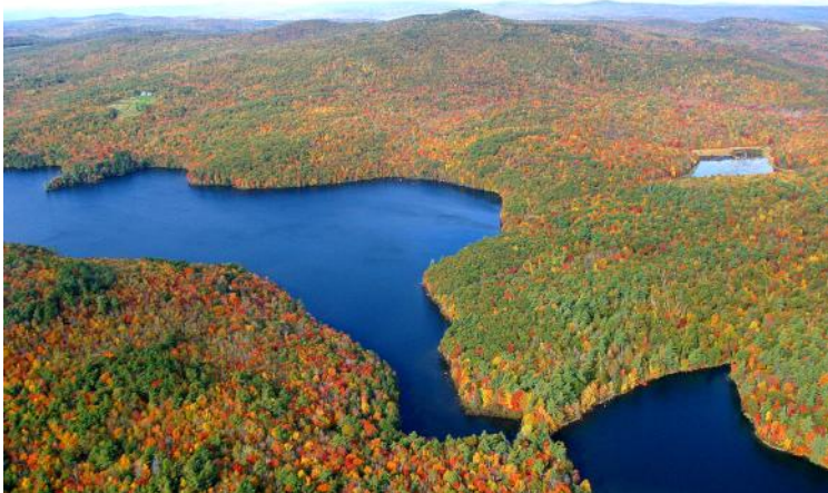
Aerial view taken above Harris Ctr. of Lake Nubanusit