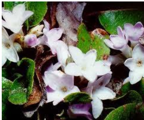
Trailing Arbutus found on Old Bridal Path