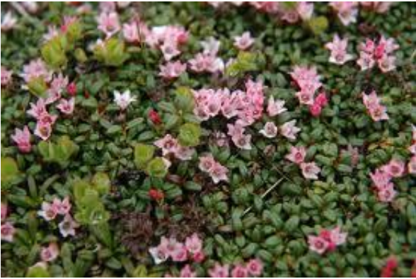
Alpine Azalea Found in the Alpine Garden