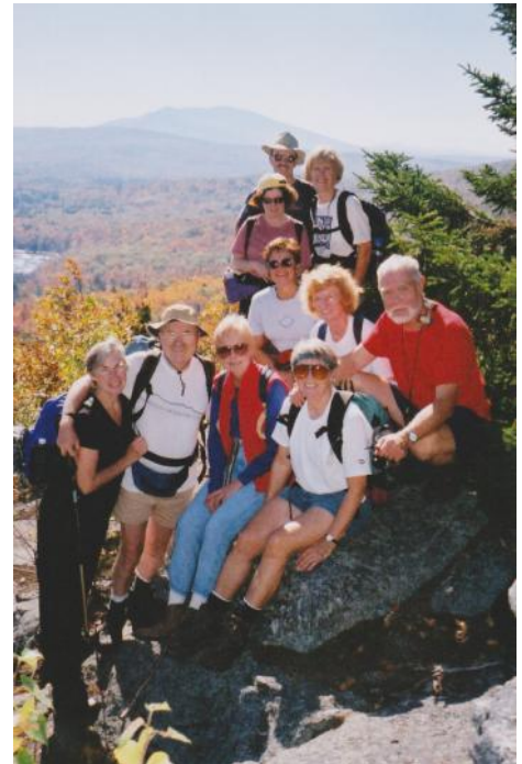
Hikers on Mt. Skatutakee