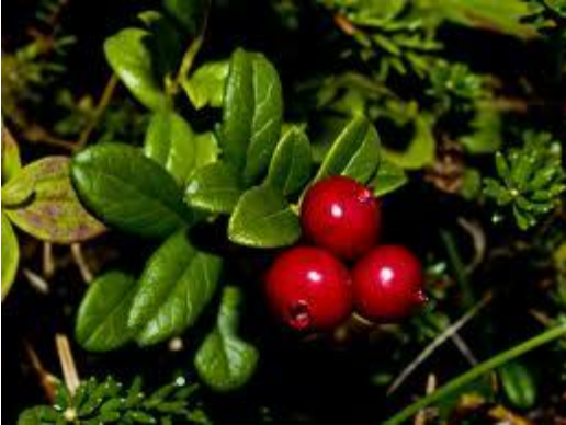
Mountain cranberry found everywhere!