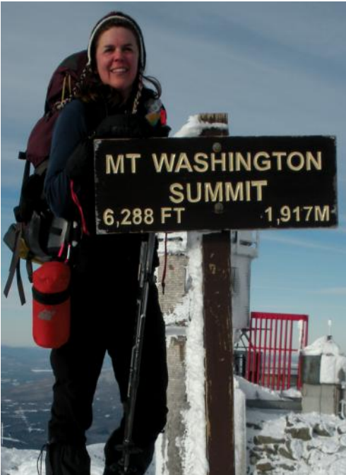
The newsletter editor enjoys a clear day on New Hampshire's highest peak

Is winter over already? Can we really look forward to hiking without snowshoes, monorails and snow covered blazes? Yes! Before we hang up the crampons for the season, let's reflect on the past winter: