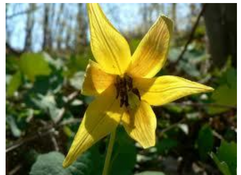
Trout Lily Found on Jewell and Scaur Ridge