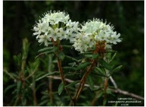
Labrador tea Found on Davis Path