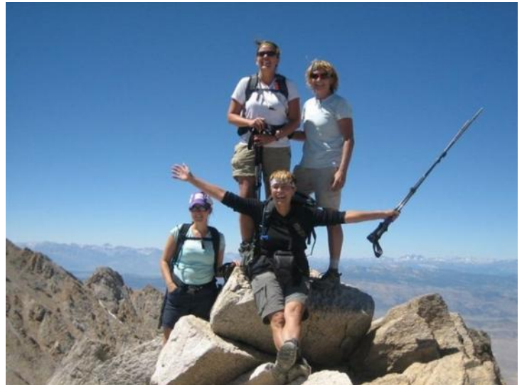
Hikers on Boundary Peak in Nevada protect themselves from the sun while bagging a great summit Summer 2010

In a hot and/or arid environment (such as high altitude areas with low humidity), sweat evaporates very quickly, so people often do not feel sweaty. Yet, they are losing water quite rapidly. In any hot environment, keep your body's fluids and salts in balance by drinking before you feel thirsty, adding electrolyte replacements to your water, and most importantly, eating salty foods while you hike. Remember that hiking curbs the appetite, so eat before you are hungry.