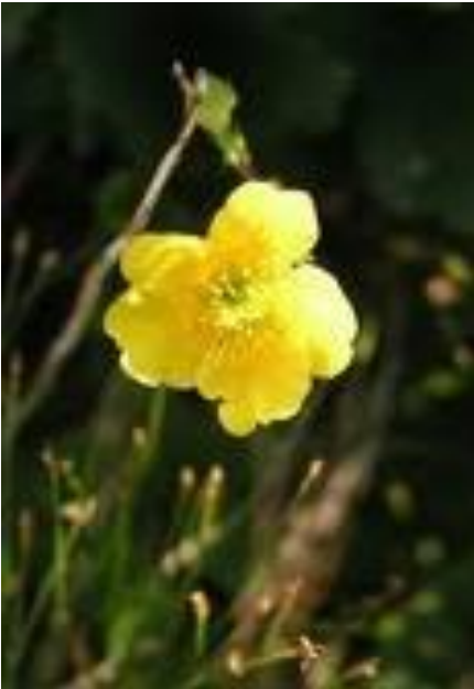
Mountain Avens Found on the North side of Eisenhower