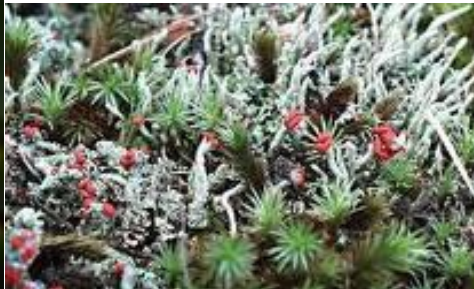
Red tipped Goblin Lichen Found everywhere