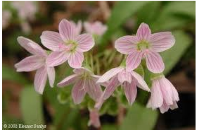
Carolina Spring Beauty Found on Jewell trail