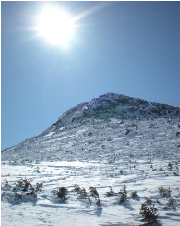
Sun over Mount Adams Winter 2010