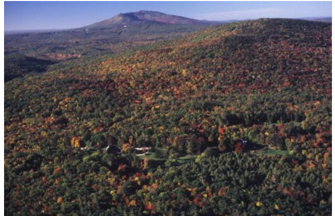
Aerial view taken above Harris Ctr. of Mts. Monadnock & Skatutakee

Year-round outdoor activities include hiking, biking, canoeing, kayaking, snowshoeing, cross-country skiing, and amateur mountain climbing. Forever protected from development – come discover the enormity of the Harris Center’s campus. Lace up your hiking boots or grab a paddle and come explore this beautiful and diverse natural area that’s ideal for adults, children, and families.