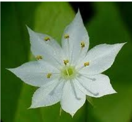
Starflower found on Edmunds Path and Webster Cliff trails