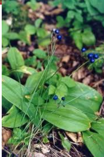
Clintonia Found on Edmunds path