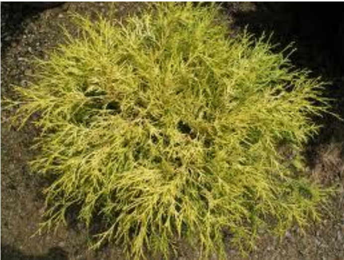
Goldthread found on Jewell Trail