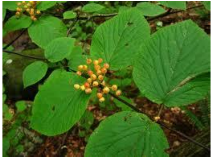
Hobblebush found everywhere!