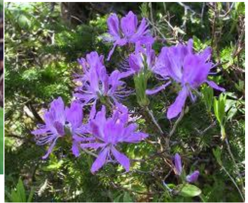
Rhodora Found on the Baldfaces