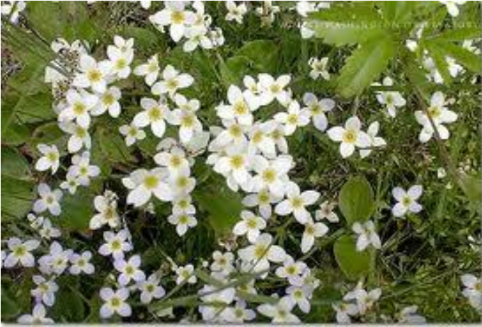
Alpine Bluets Found on Gulfside trail