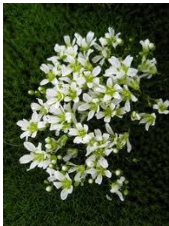
Mountain Sandwort Found on Rocky Summits