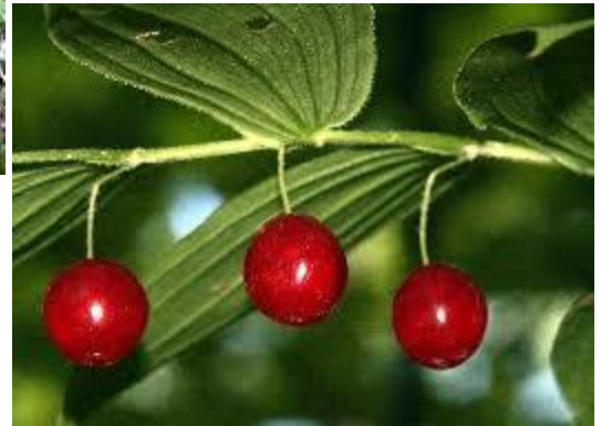
Rose Twisted Stalk Found on Crawford path near Clay