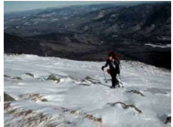
The Nelson Crag trail, Winter 2010