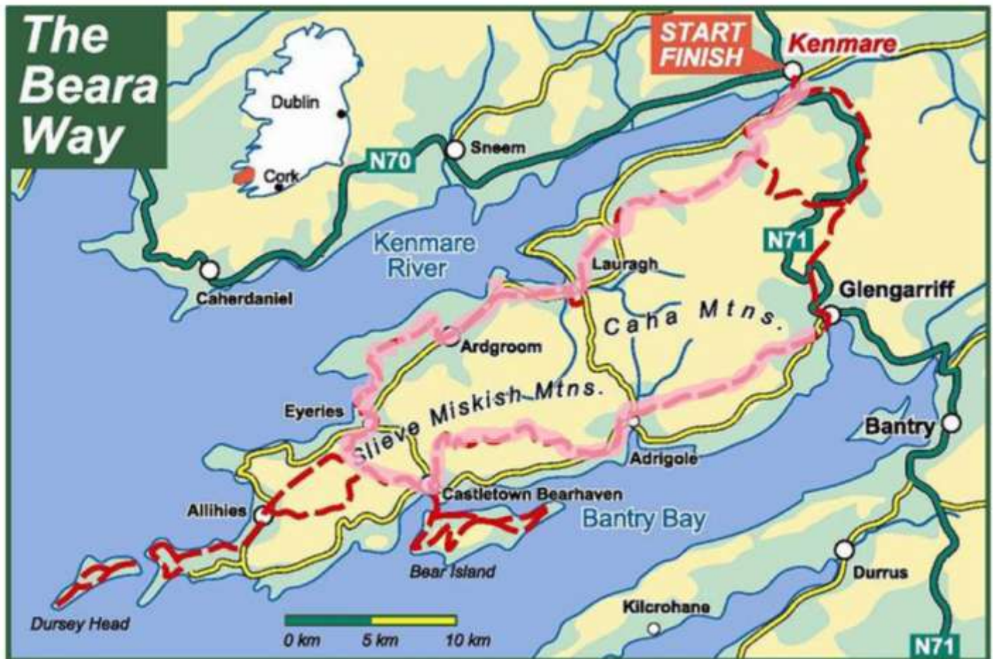
Map of Beara Way: Pink highlights above show expected route; full Beara Way and side trips are shown in red.

"Sam" (Ruth) Jamke AMC Adventure Travel Leader 603-472-2536 samjamke@myfairpoint.net