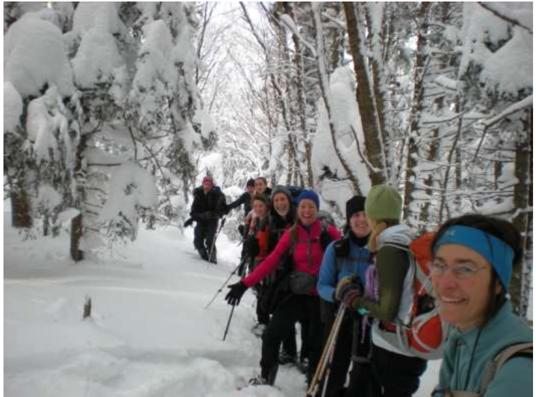
An AMC group enjoys the Garfield Trail, February 2011