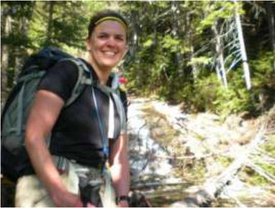
Lost in Lincoln woods! Fall 2010